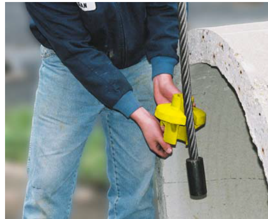
Drop pipe carrier lifting sling through hole in pipe. Align and insert “Tea Cup” pipe carrier into lifting sling.