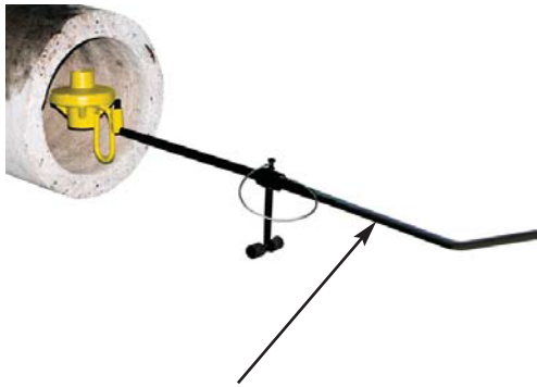
“Spoon Handle” for PC-3/4 only please order SH-3/4. (Includes bolt on lip)

Length 61.1" with slight bend for ease of use.