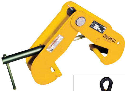
OPTION LB Large Bail