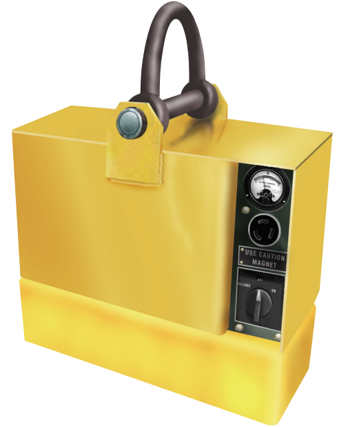
*BATTERIES NOT INCLUDED